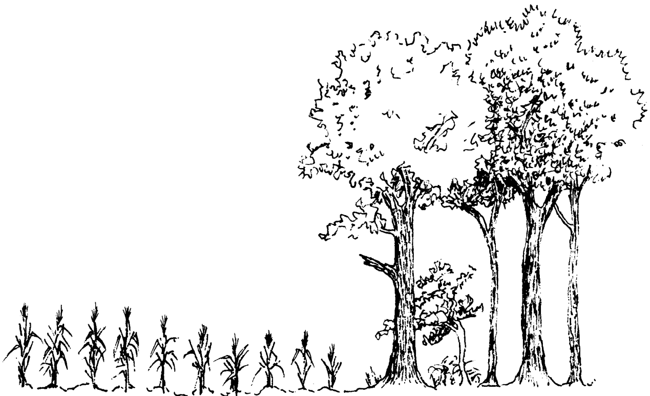
Trees often have an adverse effect on crops within 20 feet of the field edge.

Within the first 15 feet, cut small trees like dogwood, hawthorn and redcedar. Leave native shrubs